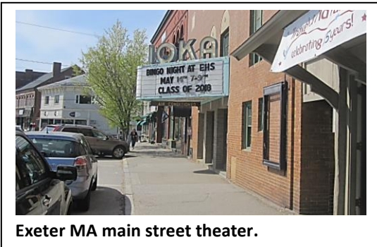
Exeter MA main street theater.