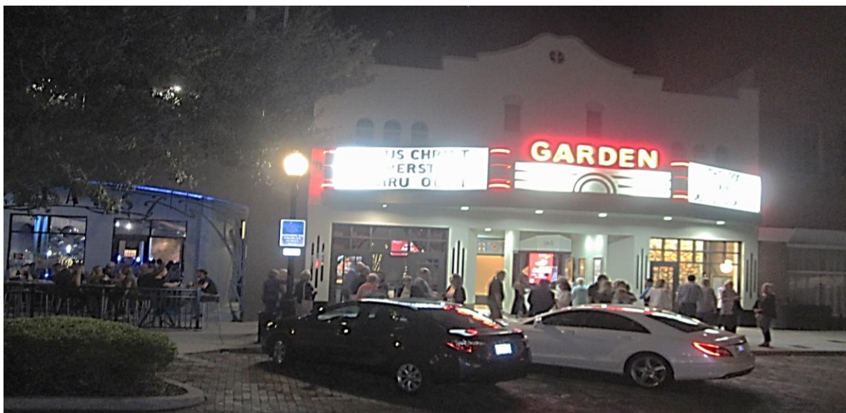
Bright lights on a Thursday night on main street in downtown Winter Garden FL.