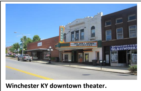
Winchester KY downtown theater.