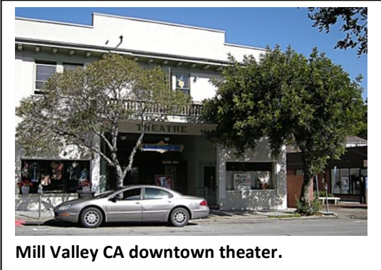
Mill Valley CA downtown theater.