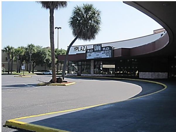
Orlando FL retail center w/retrofit theater: Plaza Live.

Theater design is important. The design of theaters as public buildings is important; there are a couple of choices. Like public libraries and local museums, community theaters come in a wide variety of shapes, styles and sizes.