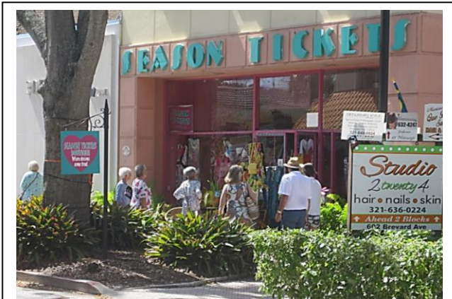
Box office in main street storefront, Cocoa Village FL.

Theaters are entertainment venues and architectural structures that are culturally relevant. Theaters are tenants, sometimes pro bono, sometimes not. Theater ticket windows can fill unused storefronts and be in the public library or other non-traditional locations.