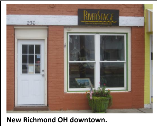
New Richmond OH downtown.

Main Street Theaters come in all sizes, styles and ages.