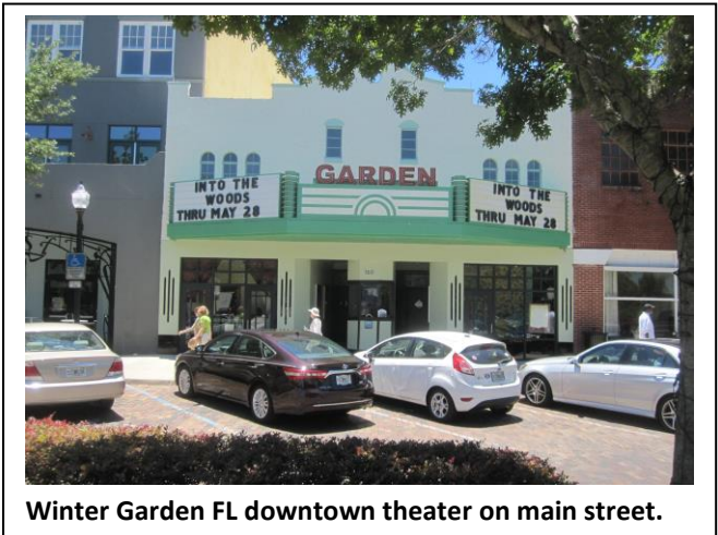
Winter Garden FL downtown theater on main street.