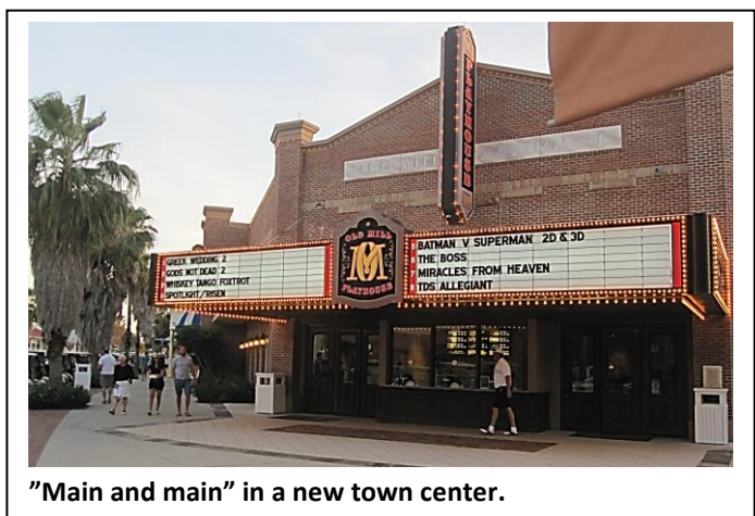
"Main and main" in a new town center.

In addition, most civic venues are under-utilized. Providing free or bargain prices to fill unused seats and spaces offers access to families who may not otherwise partake. It fills seats, sells popcorn and enhances the quality of life for everyone. Free rides and free access for non-peak cultural events is worth considering.