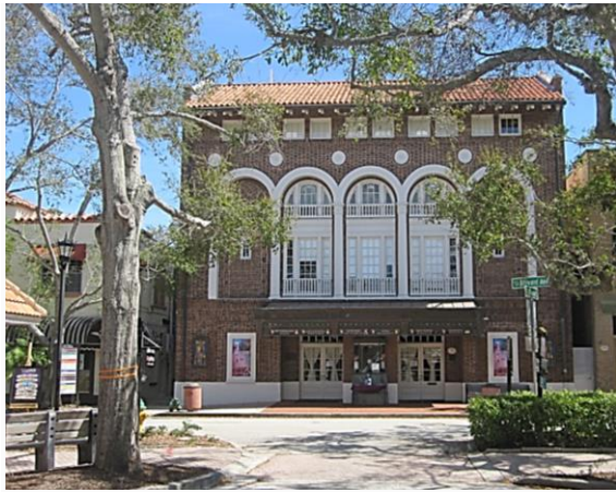
Cocoa Village FL main street theater.