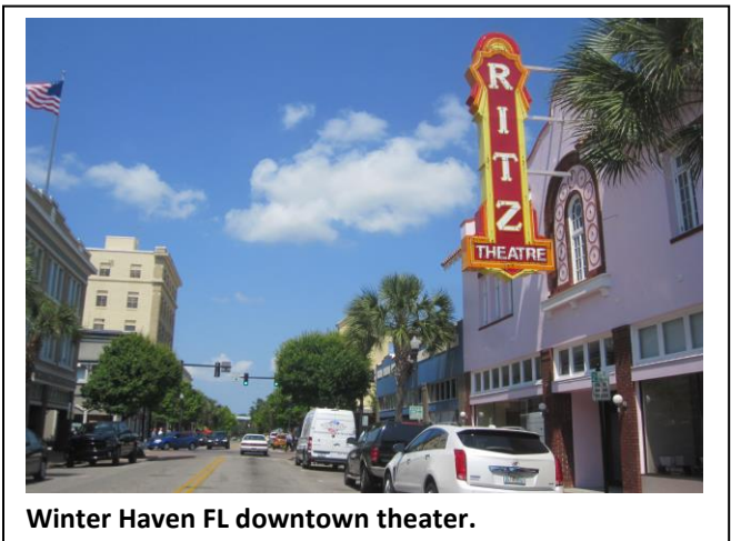
Winter Haven FL downtown theater.