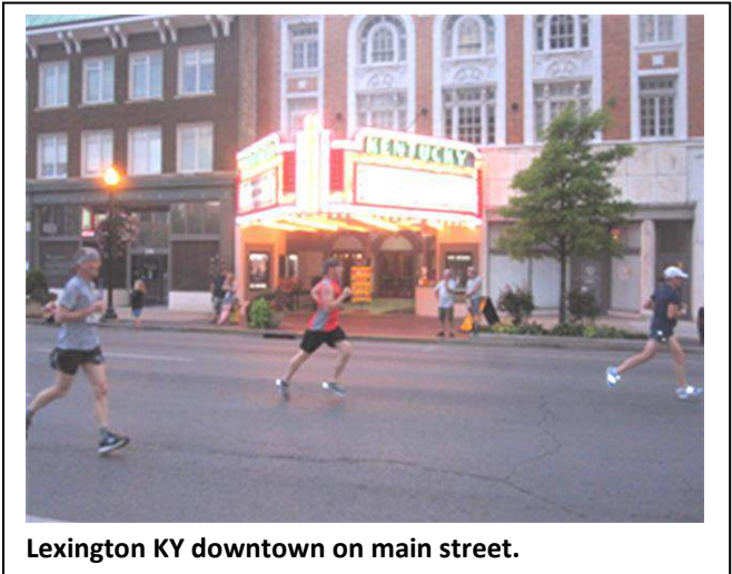
Lexington KY downtown on main street.