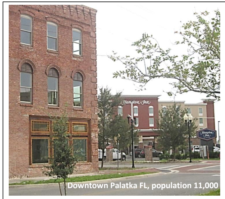
Downtown Palatka FL, population 11,000

The Highway Experience in America ; Fast Food: Roadside Restaurants in the Automobile Age ; Signs in America's Auto Age: Signatures of Landscape and Place ; and Lots of Parking: Land Use in a Car Culture . With Jefferson S. Rogers, they are also coauthors of The Motel in America ."