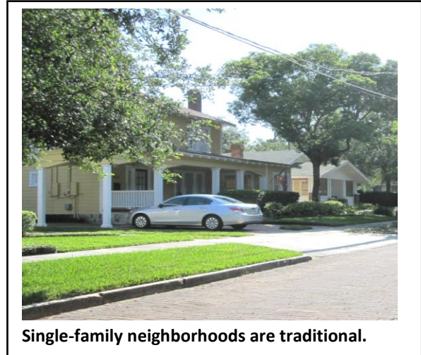
Single-family neighborhoods are traditional.