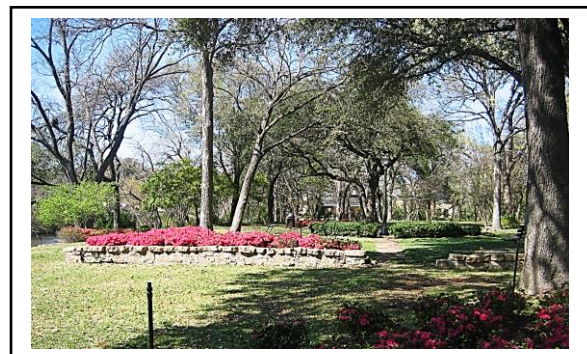
Beauty Permeates Great Neighborhoods.

Neighborhoods are more than houses and subdivisions. Neighborhoods are organic places that grow and change. They are the places where families live and participate in society. They have homes, schools, parks, shopping and other activities integral to daily life. Building neighborhoods involves creating and strengthening all these places as a system.