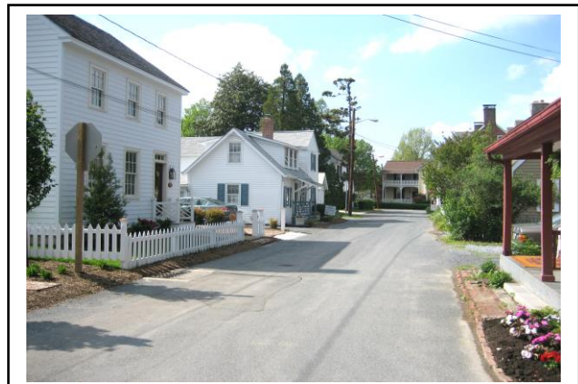
Housing of all types accommodate price variety.