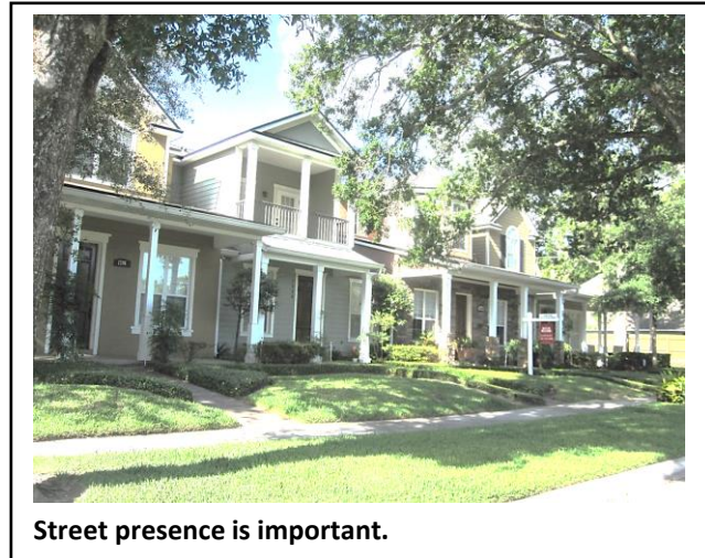
Street presence is important.