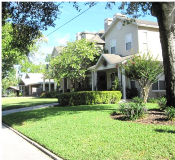
New homes in older neighborhoods.