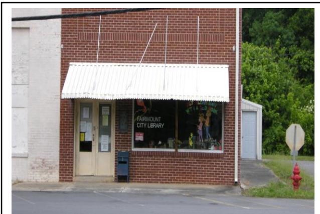
Neighborhood Libraries are a Luxury, No Matter How Humble.