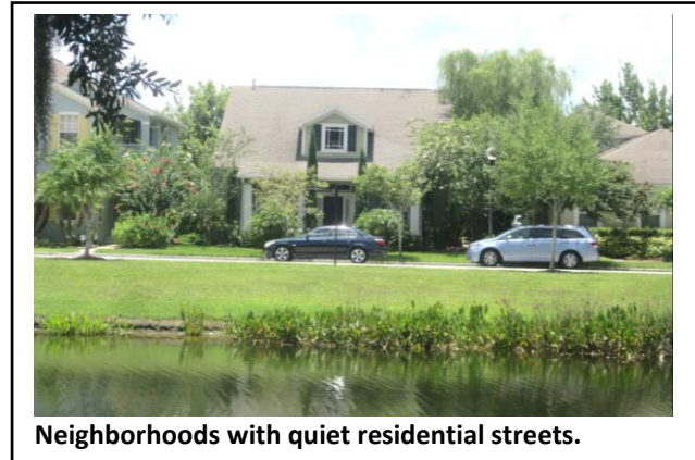
Neighborhoods with quiet residential streets.