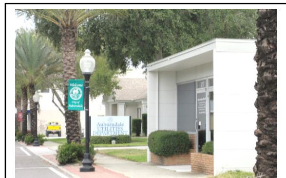
Downtown bill-paying supports neighborhoods.