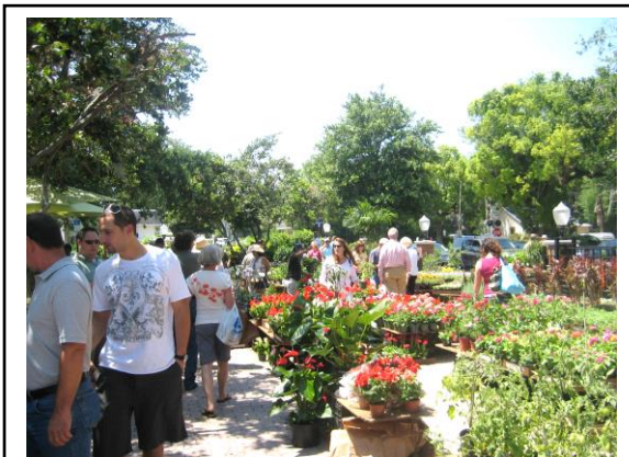
Farmers' markets are regular meeting places that build community.