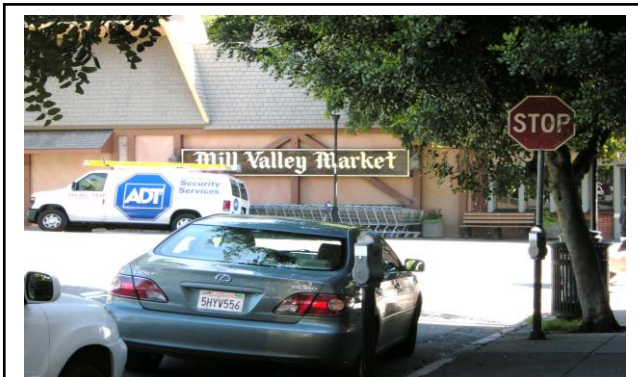
Walk-To Grocery Stores are Fine Neighborhood Amenities.