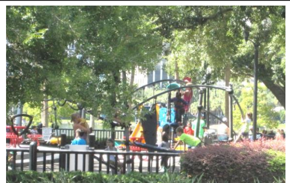
Neighborhood parks and schools are great gathering places.