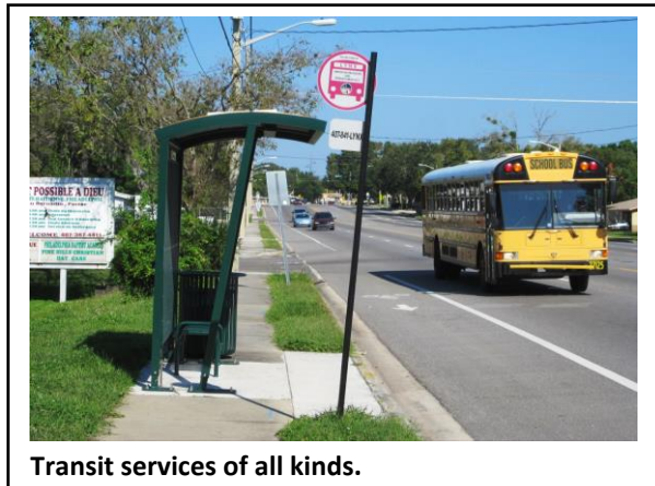
Transit services of all kinds.