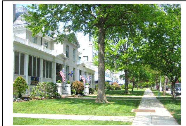
Older neighborhoods are invaluable.

The city is in a great position to educate neighborhood leaders and organizers knowing that a better informed and educated citizenry is a community asset.