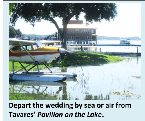
Depart the wedding by sea or air from Tavares' Pavilion on the Lake.