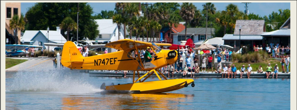
Tavares’ Wooton Park.

The Tavares Seaplane Base & Marina (FA1) is a seaplane airport and recreational boating marina located on the Lake Dora waterfront in the heart of Tavares’ Wooton Park. The Prop Shop is in the historic Woodlea House located by the Seaplane ramp.