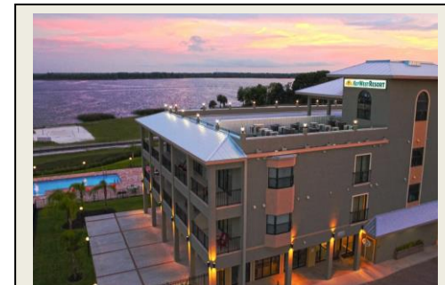
The Key West Resort on Lake Dora