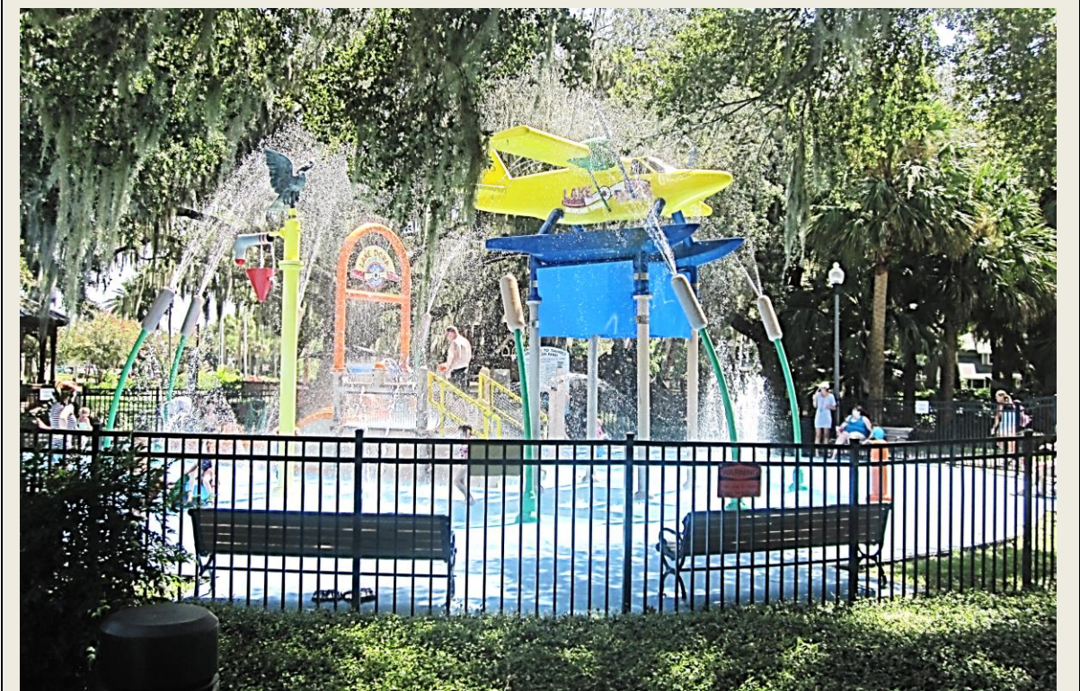
The seaplane theme is everywhere...Wooton Lakefront Park