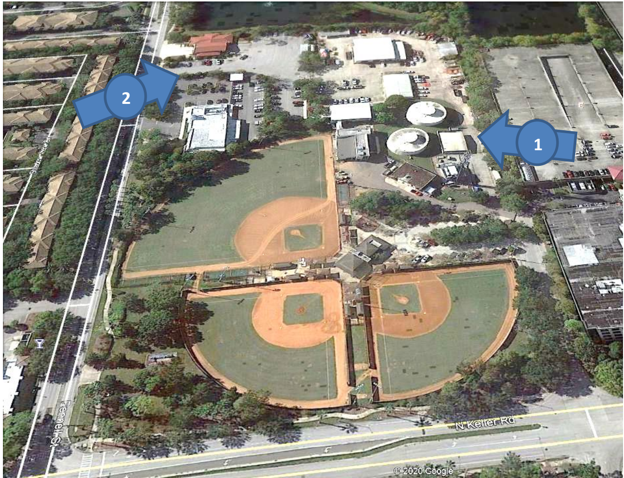
First Station #47 at the top left [1]; public works water plant top right [2] plus ball fields and a concession building.

The City of Maitland married two ideas in 1990: they had surplus land at the Keller Road Public Works site, home to their water plant [2] and Fire Station #47 [1]; and they needed a little league field for residents. The result of their co-location thinking was The Maitland Ballfield Complex. It has two 200' baseball fields, one 300' field with restrooms and a concession stand. This is the primary home site for Maitland Little League.