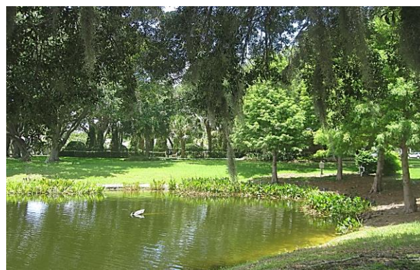
A neighborhood retention pond; an amenity.

Designing the downtown with the same care and attention given to a highly visible, highly active public park requires the same balance of aesthetics and function.