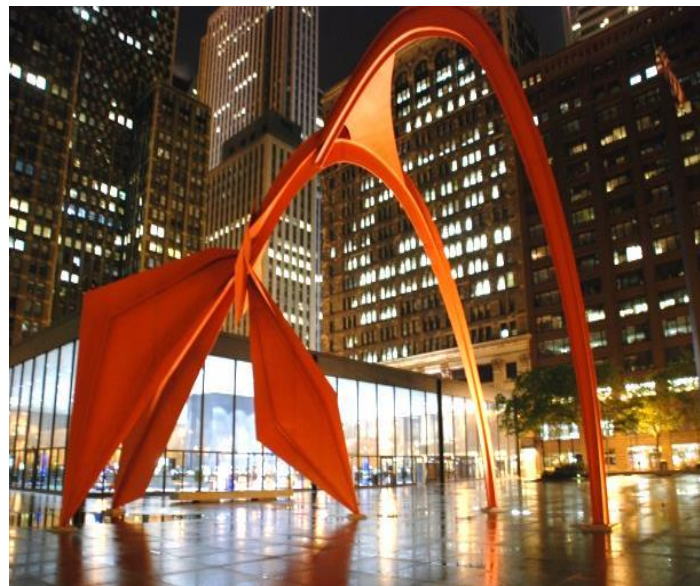
Public art; a testament to community values.