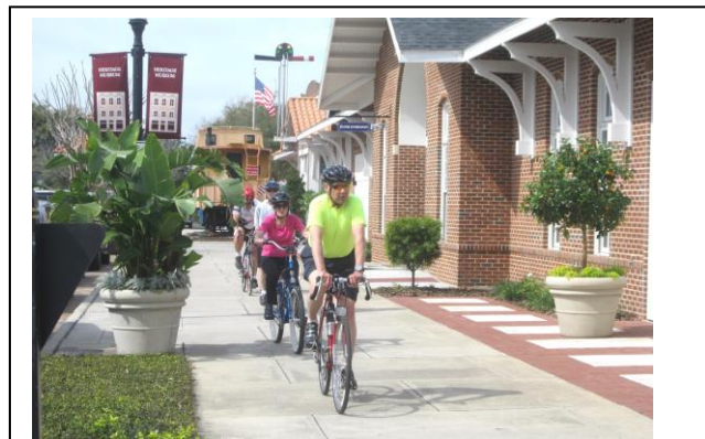
Urban trails connect parks and civic spaces

Trails can use utility easements, drainageways and street corridors with sufficient space for safe pedestrian and bike travel. Using established corridor lands enables the trail system to be extensive without having to buy new property. "Rails-to-trails" is a model that can be applied to many other types of linear corridors.