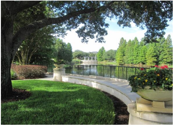
Urban stormwater as a park-side pond.

Creating places and spaces for happy memories is an important city function.