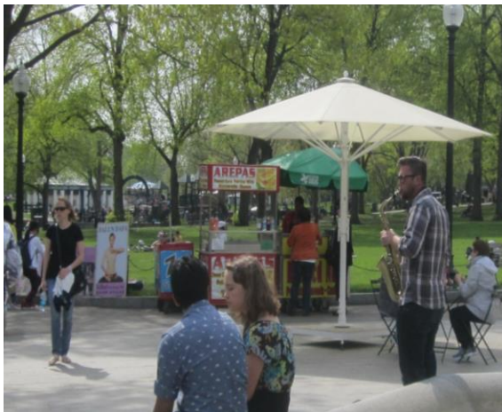
A concert in the park teaches the value of culture.