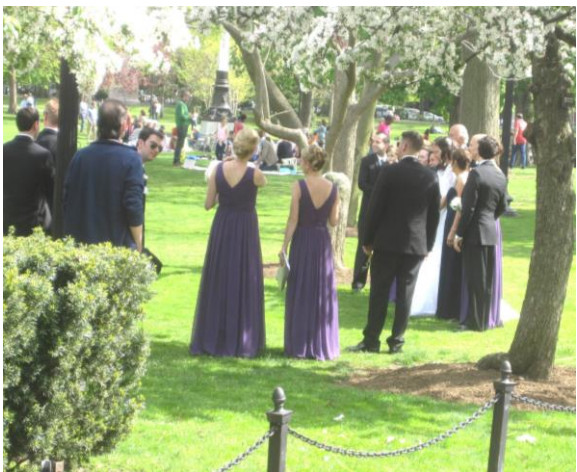
A public garden is a memorable personal place.