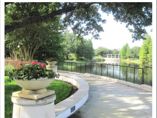
A park, a pathway and a pond for stormwater.