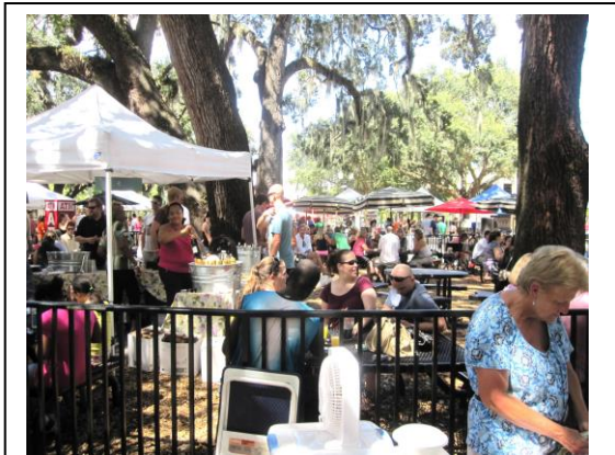
Active parks with music and food.

The park system also incorporates many environmentally sensitive lands. Parks are the major component of the urban open space system and amplify their benefits when connected.