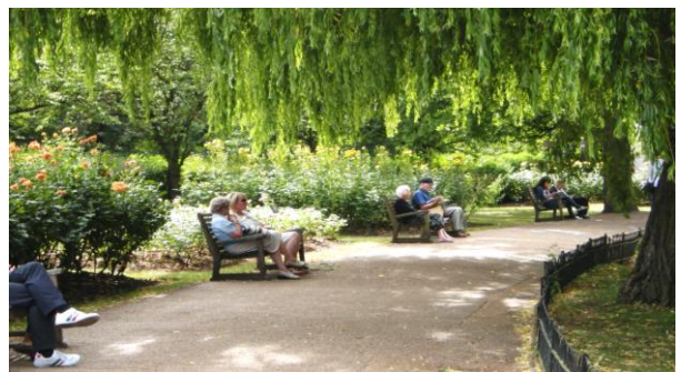
All the benches are full.