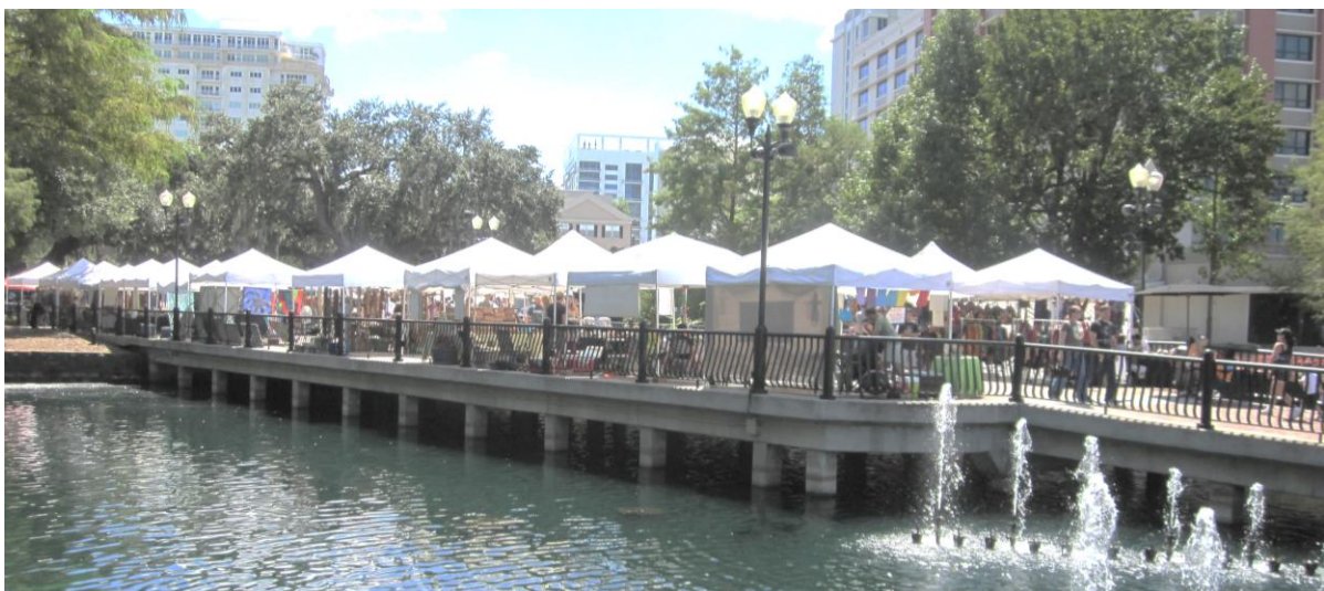
Saturday in the park.

Really “complete streets” provide for all modes of travel and of life. They are streets, trails, parks and spaces that beautifully and walkably connect homes, parks, shops, offices and schools.