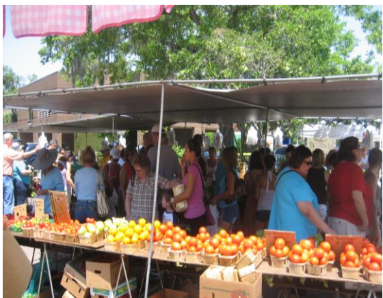
Enjoy the downtown market.