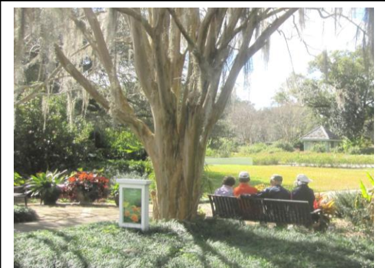
Public urban gardens.