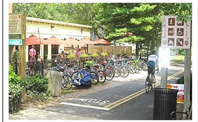
A downtown "third place".