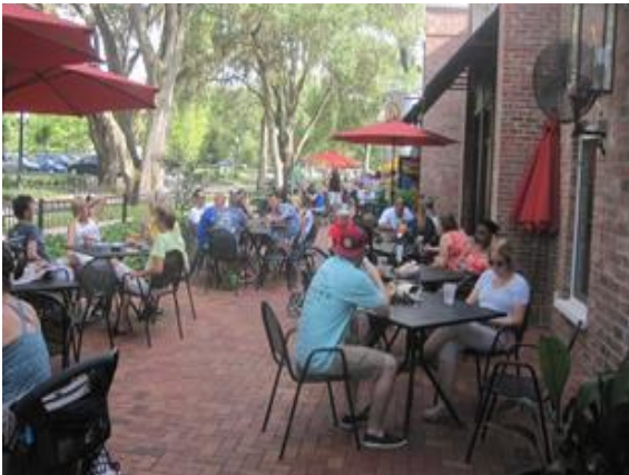
Lunch and business and pleasure, all in a park.