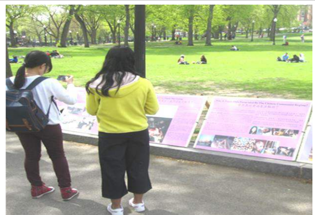
City parks as classrooms.