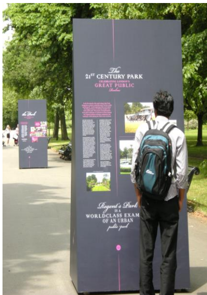
City parks are great classrooms.