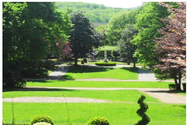
A quieter place.

Design and site every building to reinforce the park-like setting of main street. Place them, design them and use them as connected features that let the green spaces define the downtown.