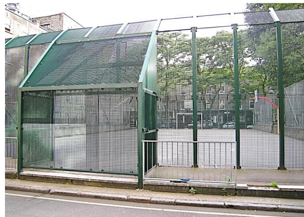
Use every niche!; Once a parking lot, now an urban soccer “Pitch”.

Urban open space also takes the form of hard-surface recreation places used by the public. The pictured urban soccer pitch is an example of the creative use of a parking lot.