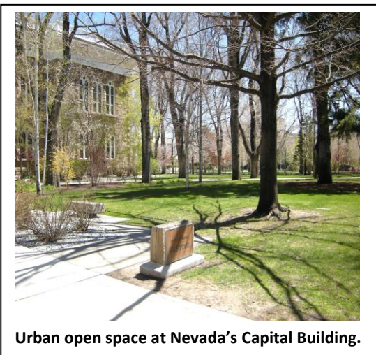
Urban open space at Nevada's Capital Building.

Shared facilities provide real benefits, such as the use of public school grounds as a public community park, or the excess land at a water plant for a Little League field. Joint Use Agreements with other owners of parks and open spaces, like the school board, that cover insurance, hours of use, maintenance obligations and security can quickly multiply the inventory of local parks.