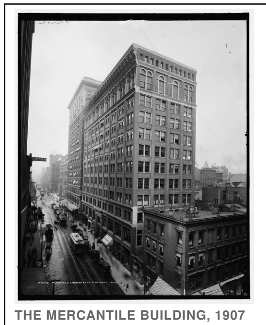
THE MERCANTILE BUILDING, 1907

In the beginning, they struggled to build a membership that could pay sufficient dues to meet their costs, but as their ranks and collection grew, the library found stability and commodious quarters in the Cincinnati College Building on Walnut Street. From there it would grow to influence the region’s cultural, commercial, and literary landscapes, hosting prominent lecturers and counting among its members men, and beginning in 1859 women, who went on to leave their indelible mark on the city and region.