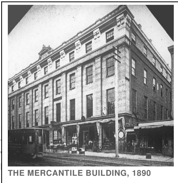
THE MERCANTILE BUILDING, 1890

Subscription libraries like this sprang up across North America following the example of The Library Company of Philadelphia, founded in 1731 by Benjamin Franklin and a circle of his friends. By the 19th century, libraries were evolving specific to class and profession. Mechanics Institutes served technical tradesmen. Athenaeums and Society libraries catered to certain classes and social circles.