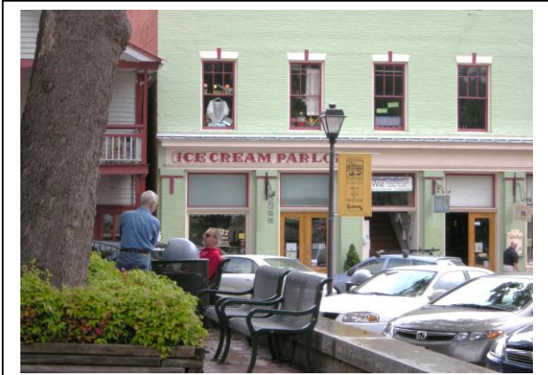
Downtown Dahlonega, Ice Cream and Fudge.