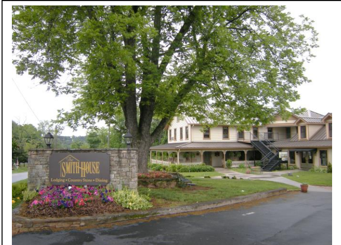
The Smith House Historic Inn has 16 rooms on property, plus 23 rooms in our new Lodge, 4 villas located right on the historic town square and 2 cottages - all located indowntown Dahlonega. The Smith House with 22 rooms opened to visitors since 1899.