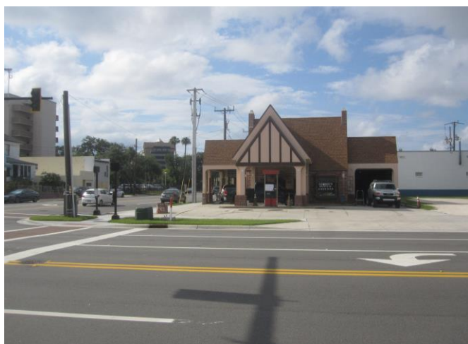
Daytona Beach, FL, a survivor into the 21 st century.

Gas stations are infrastructure, as we have recently come to appreciate; they can be – used to be – beautiful.