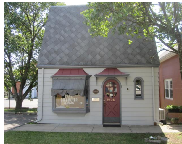
A very chic jewelry store, Montgomery OH...a survivor.