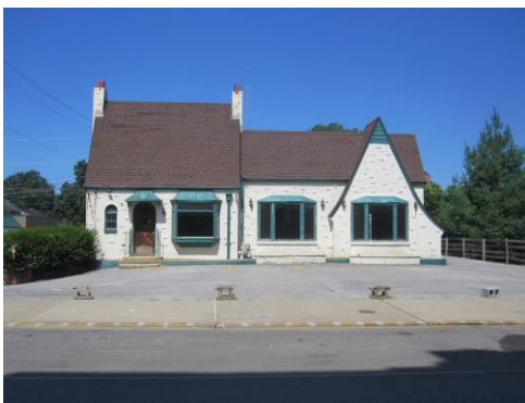
Paris, KY, a 21 st century survivor.