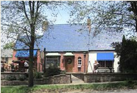
Former Pure Oil Gas Station, now repurposed as a restaurant, Saratoga Springs, NY

It is a one-story, brick building in three sections, measuring 34 feet by 27 feet. It consists of the main block housing the office with a rear wing and one stall garage. It features a steeply pitched roof of durable tile. [2] It was listed on the National Register of Historic Places in 1978. [1] The building has now been adapted for reuse as a restaurant.