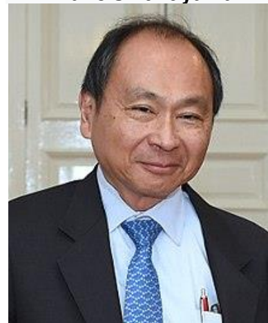
American political scientist , political economist , and writer.