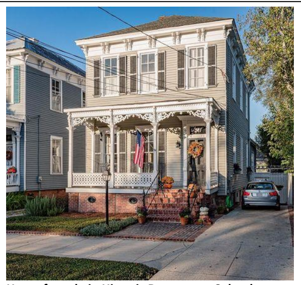
Home for sale in Historic Downtown Columbus.