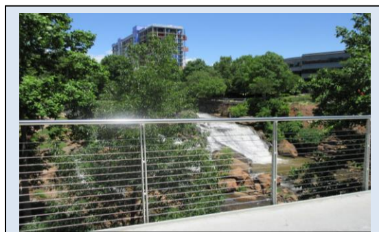
Rails can be safe and stylish.