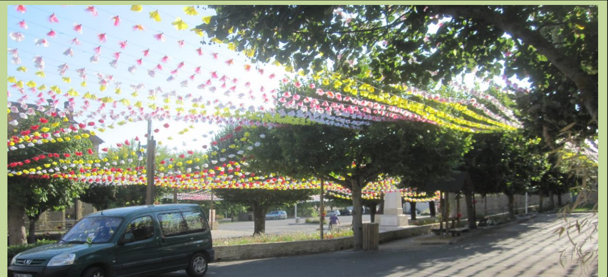
A car park gets a ceiling and a festival.