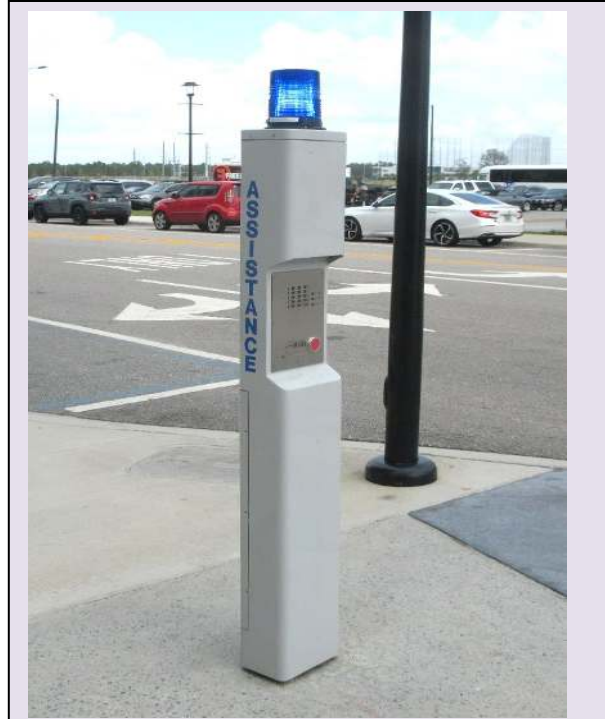
An urban assistant.