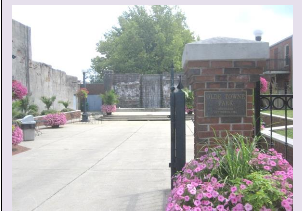
A downtown park/plaza in a vacant building site.