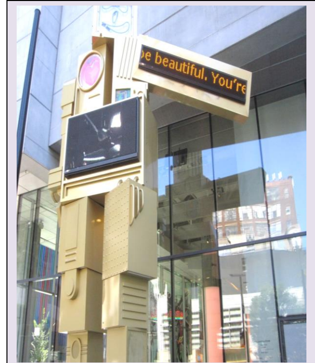
A proponent of beauty.