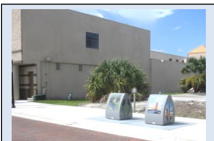
Not your grandads' dumpsters.