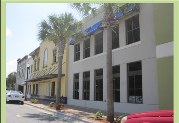
A parking deck disguised as a storefront.