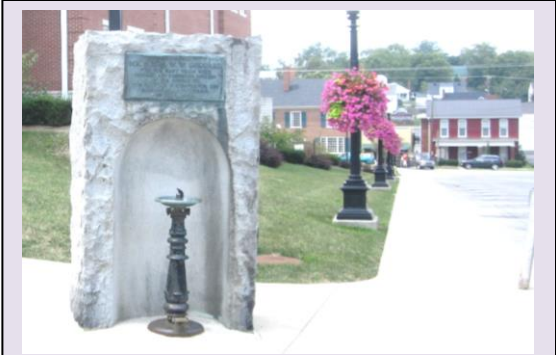
A drinking fountain.