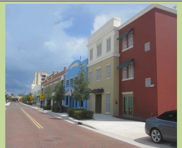
Another parking deck appears as a storefront.