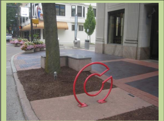
A bike rack in Columbus IN.