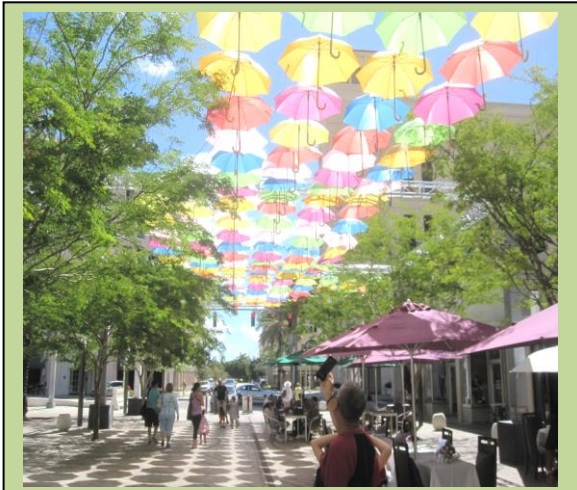
A downtown street gets a ceiling and a festival.