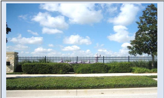
You can barely find the backflow preventor.