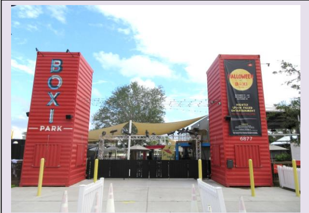
A park made of box cars.