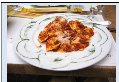
Presentation is an art form.