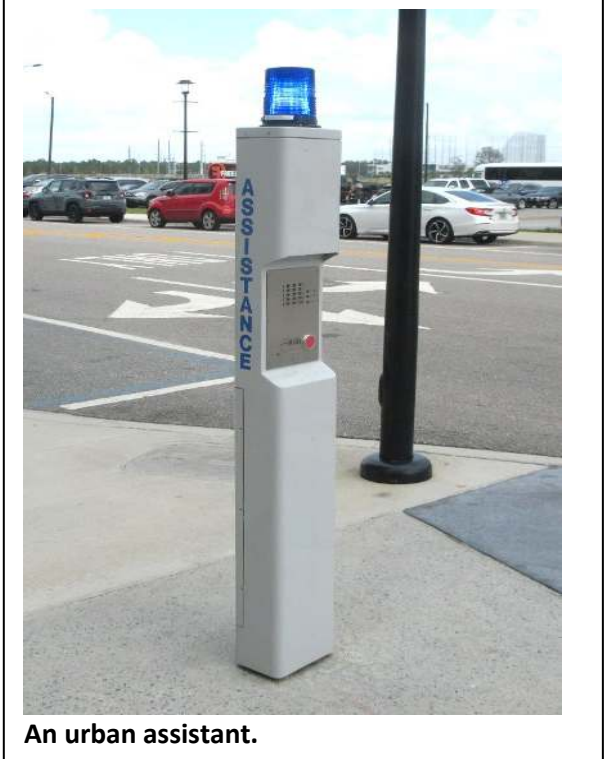
An urban assistant.