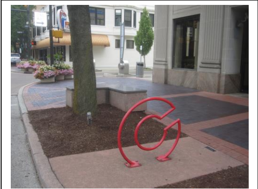
A bike rack in Columbus IN.