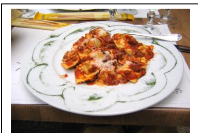
Presentation is an art form.