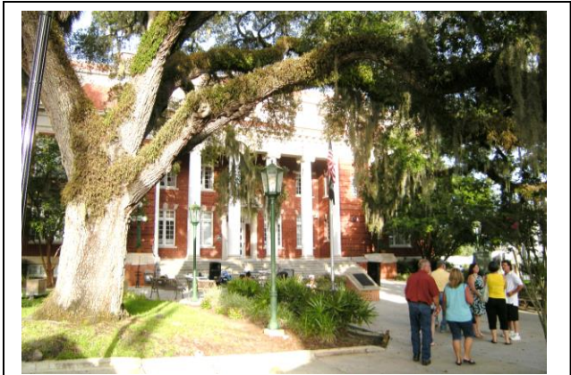
Civic buildings in small towns can be grand.