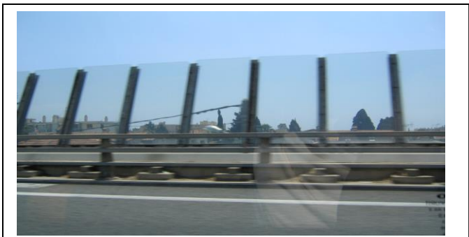
Highway sound walls can take many forms.