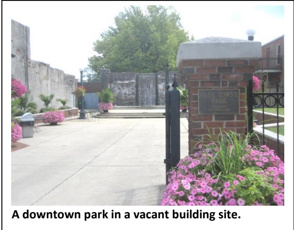
A downtown park in a vacant building site.