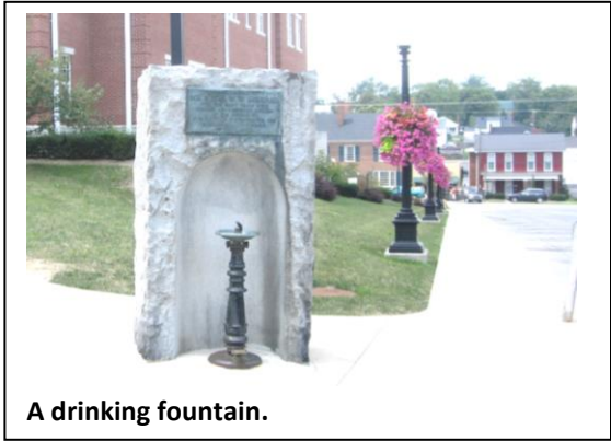
A drinking fountain.