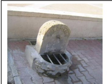
Someone designs everything.