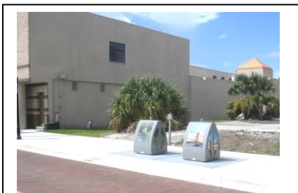
Not your grandads' dumpsters.