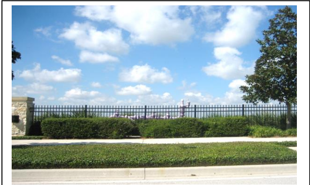
You can barely find the backflow preventor.