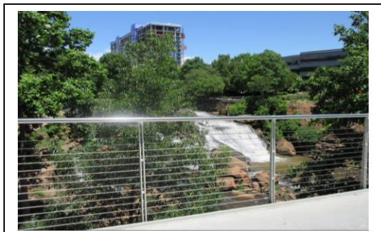
Rails can be safe and stylish.