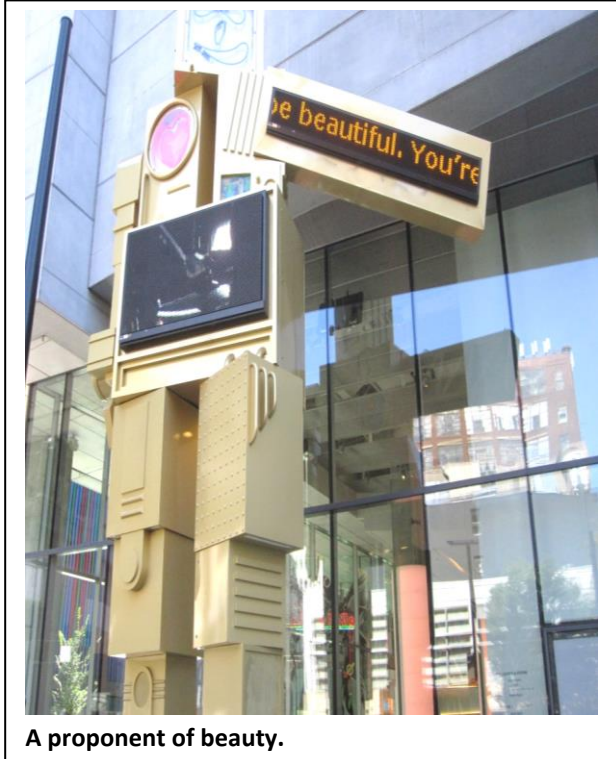
A proponent of beauty.