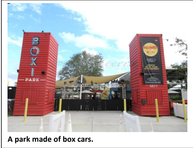
A park made of box cars.