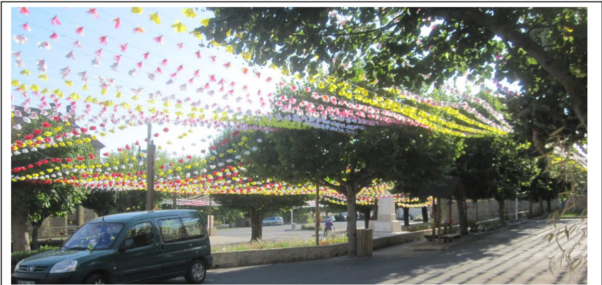
A car park gets a ceiling and a festival.