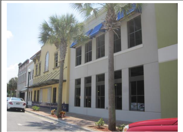
A parking deck disguised as a storefront.