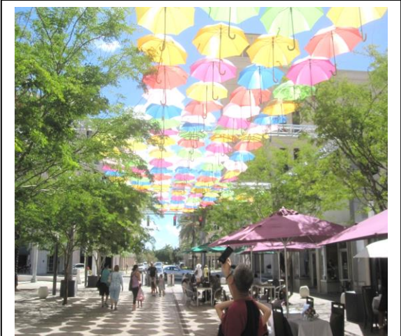
A downtown street gets a ceiling and a festival.