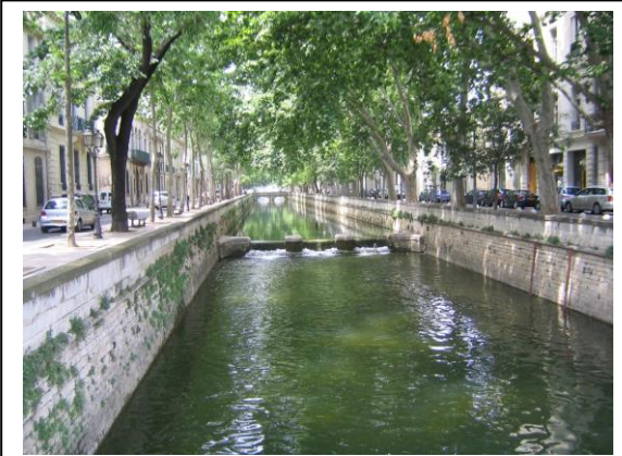
A drainageway can be an amenity.