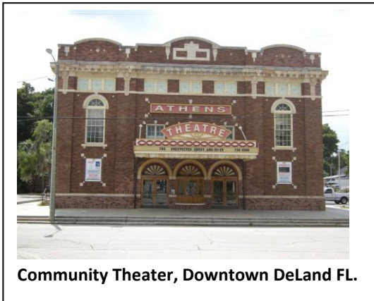
Community Theater, Downtown DeLand FL.