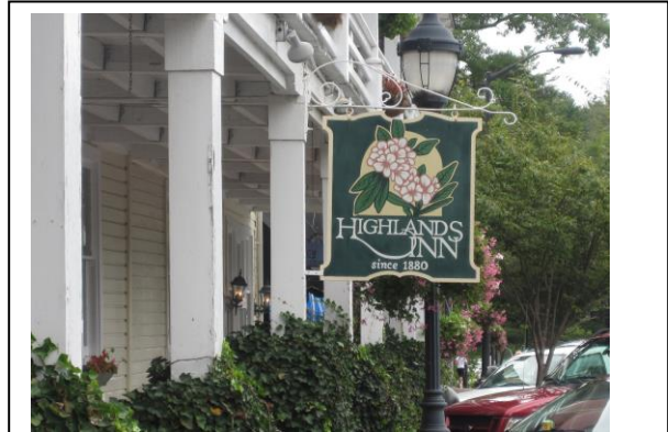
Character Hotel Downtown, Highlands NC.