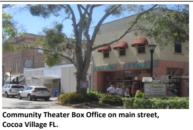
Community Theater Box Office on main street, Cocoa Village FL.