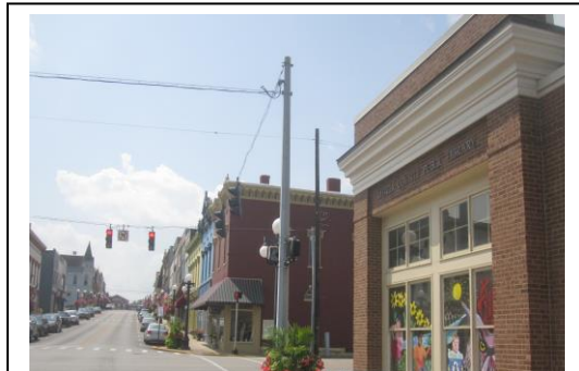
Mercer County Public Library at the foot of Main Street, Harrodsburg KY.