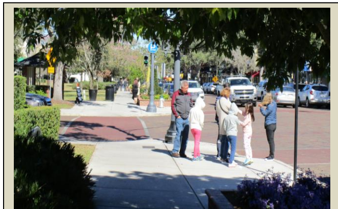
Small city visitors looking to find their way.