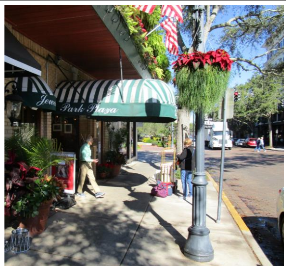
Boutique hotels fit character main streets.

The “unknowables” of mid-21 st Century main streets are simple. Except for the mysterious future of transportation, communication, housing, education and health systems, the future is clear.