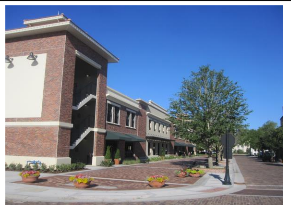
Winter Garden – Another attractive parking deck located one street over from main street.