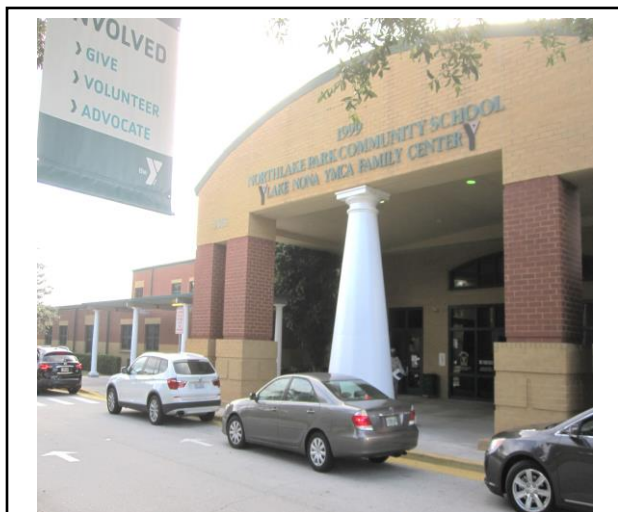
NORTHLAKE PARK COMMUNITY SCHOOL Is co-located with Lake Nona YMCA Family Center and a City Park; in the heart of a neighborhood.