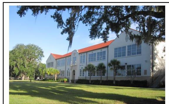
THE PRINCETON NEIGHBORHOOD SCHOOL in Orlando FL is within the neighborhood having immediately adjacent to: