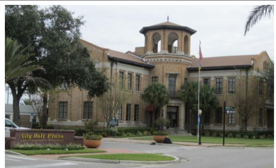
A character city hall in a main street park.