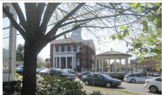
An historic city hall on main street.