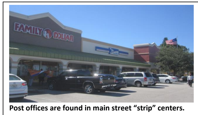
Post offices are found in main street "strip" centers.