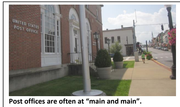
Post offices are often at "main and main".