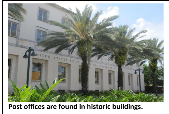
Post offices are found in historic buildings.

Look for opportunities to locate the post office with other compatible uses; even with FedEx or UPS. Like many other institutional systems, the postal service is changing its business model.