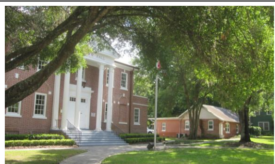
A small town with a notable downtown city hall.

Energy attracts energy, and investment in downtown attracts more investment in downtown. High technology infrastructure like high speed broadband internet service is no longer a differentiator, it is a “must have.” It benefits the city and the many businesses on main street seeking a global connection.